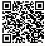
Gum Nut Community

These groups are used for collaboration with families, sharing information about upcoming events and program.